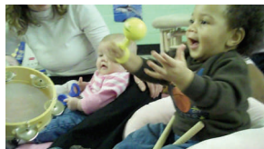
Enrichment opportunities include music classes, field trips, and community building.