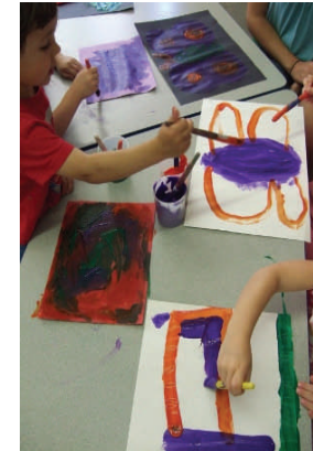
Classroom instruction builds from the natural interests presented by our children.

Our full-day child care serves children from 8- weeks to 5 years of age. Children are placed into classrooms by age.